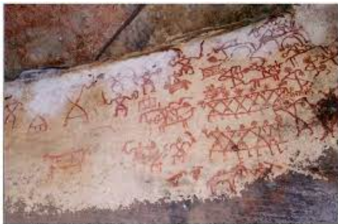
Diagrams, lower right; elephant, upper right; Lion, human and animal figures, Chitrakoot, Uttar Pradesh, U.P.

DESIGN AND DECORATE PAPER CUTOUTS WITH CHIKANKARI PATTERNS USING WHITE MARKERS, EXPLORING THE ESSENCE OF THIS TRADITIONAL INDIAN EMBROIDERY.