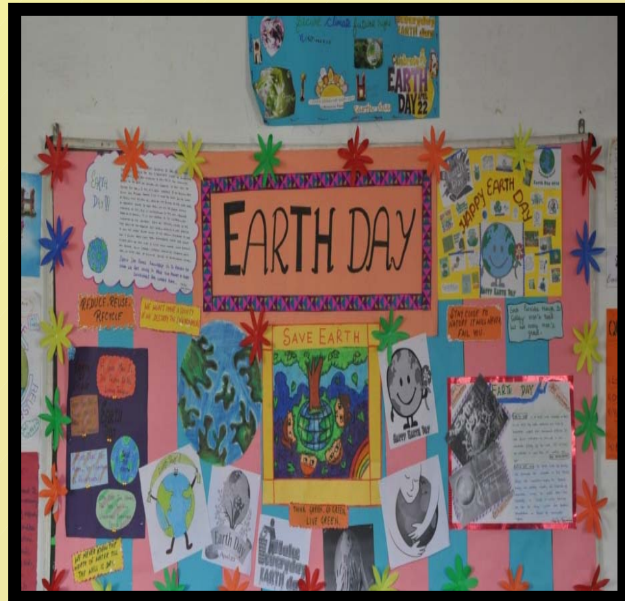
Hansraj Model School Punjabi Bagh , New Delhi