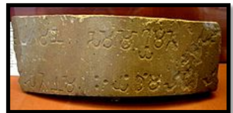
Fragment of the 6 th Ashokan

MEERUT ALSO CONTAINED A HARAPPAN SETTLEMENT KNOWN AS ALAMGIRPUR . MEERUT WAS AN IMPORTANT CENTRE OF BUDDHISM IN THE PERIOD OF MAURYAN EMPEROR. REMAINS OF BUDDHIST STRUCTURES WERE FOUND NEAR THE JAMA MASJID IN THE PRESENT DAY CITY. THE ASHOKA PILLAR , AT DELHI RIDGE