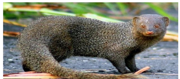
Indian Grey Mongoose ( Herpestes Edwardsi )