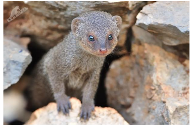
Small Indian Mongoose ( Herpestes Javanicus )