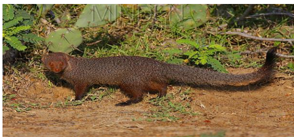
Ruddy Mongoose ( Herpestes smithi )