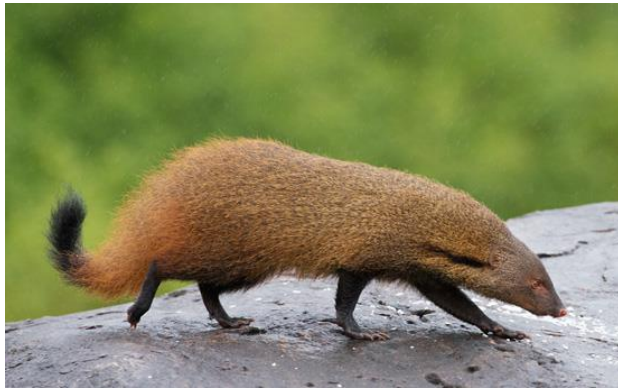
Strips-necked Mongoose ( Herpestes vitticollis )