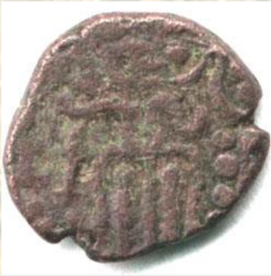
Pandya chola fish coin

The Government Museum in Chennai has a huge collection of coins in gold, silver, copper, lead, potin and billion from ancient, medieval and modern periods and also foreign coins. The Pandyas were one of the three dynasties who ruled Tamil Nadu during the Sangam period (circa 500 BC - circa 200 AD). The Pandyas issued square silver punch marked and die struck copper coins in their early period. The coins had elephant, fish sometimes boars carved on them. The inscription on the silver and gold coins is in Sanskrit and for copper coins; they have Tamil legends on them.