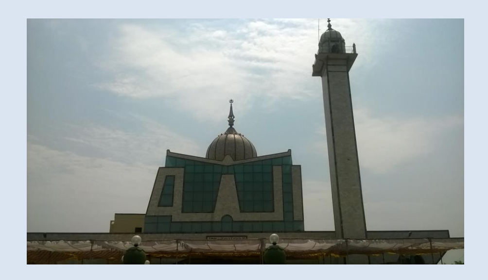
JAMA MASJID, BHILAI

The Jama Masjid in Bhilai, Chhattisgarh is the largest mosque in the state. The idea of such mosques is to accommodate a large number of people, who can easily congregate to pray together.