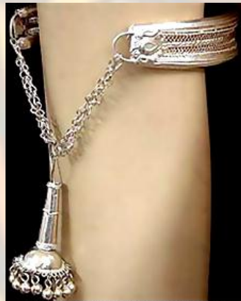
Silver jewellery of Jharkhand