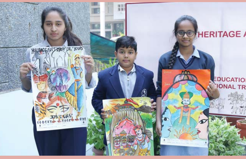
Route to Roots Poster Competition