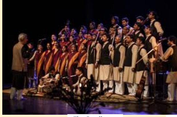
The Gandharva Choir

The Gandharva choir is one of the country's most prestigious choirs, having performed in places like Lincoln Centre, New York, which is one of the most accomplished stages any performer can reach. They have also sung in many music festivals worldwide as well as throughout the country. Its conductor is Pandit Madhup Mudgal. Only exceptional students join the choir, which has space for both singers and musicians.