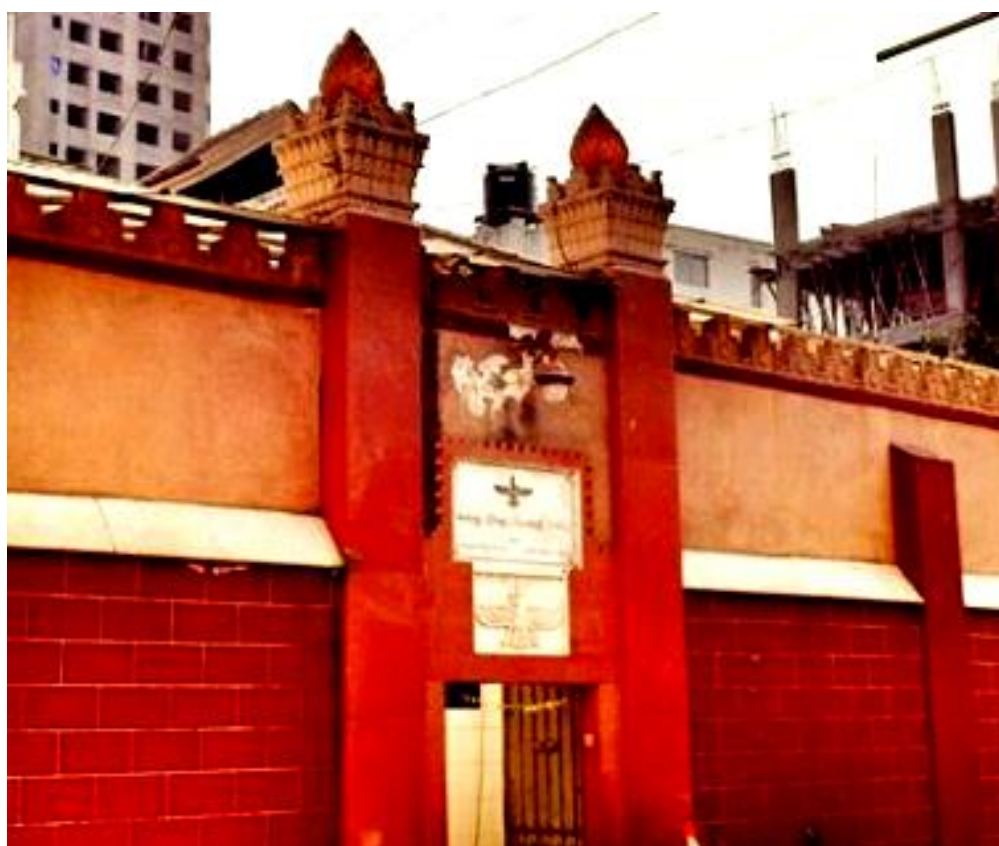
Banaji Limji Agiary